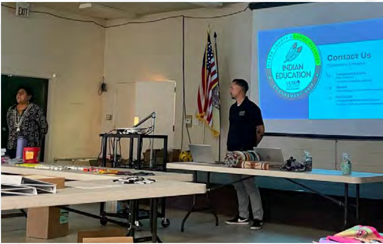
Moapa Tribal Hall

This year IEOP collaborated with The Moapa Education Committee and The Las Vegas Indian Center to hold two back to school supply and resource fairs. Title VI funds were used to help assist students with supplies and through collaborative efforts students both rural and urban were able to be say farewell to Summer with resources in hand. Bird Singers from Moapa blessed us with their presence in the Moapa Tribal Hall and the Bird Bros from Chemehuevi Valley and Parker at The Las Vegas Indian Center. Thank you to everyone who made these events such a success!