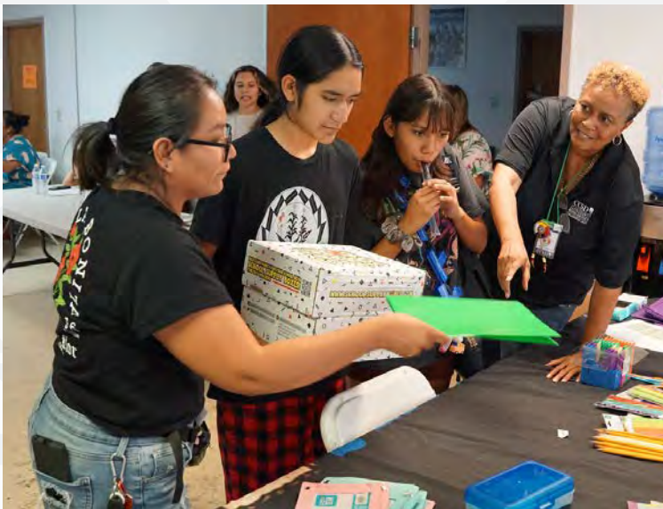
Las Vegas Indian Center