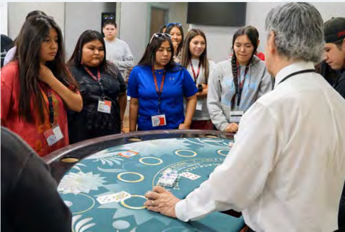
Inside the UNLV Hospitality Building