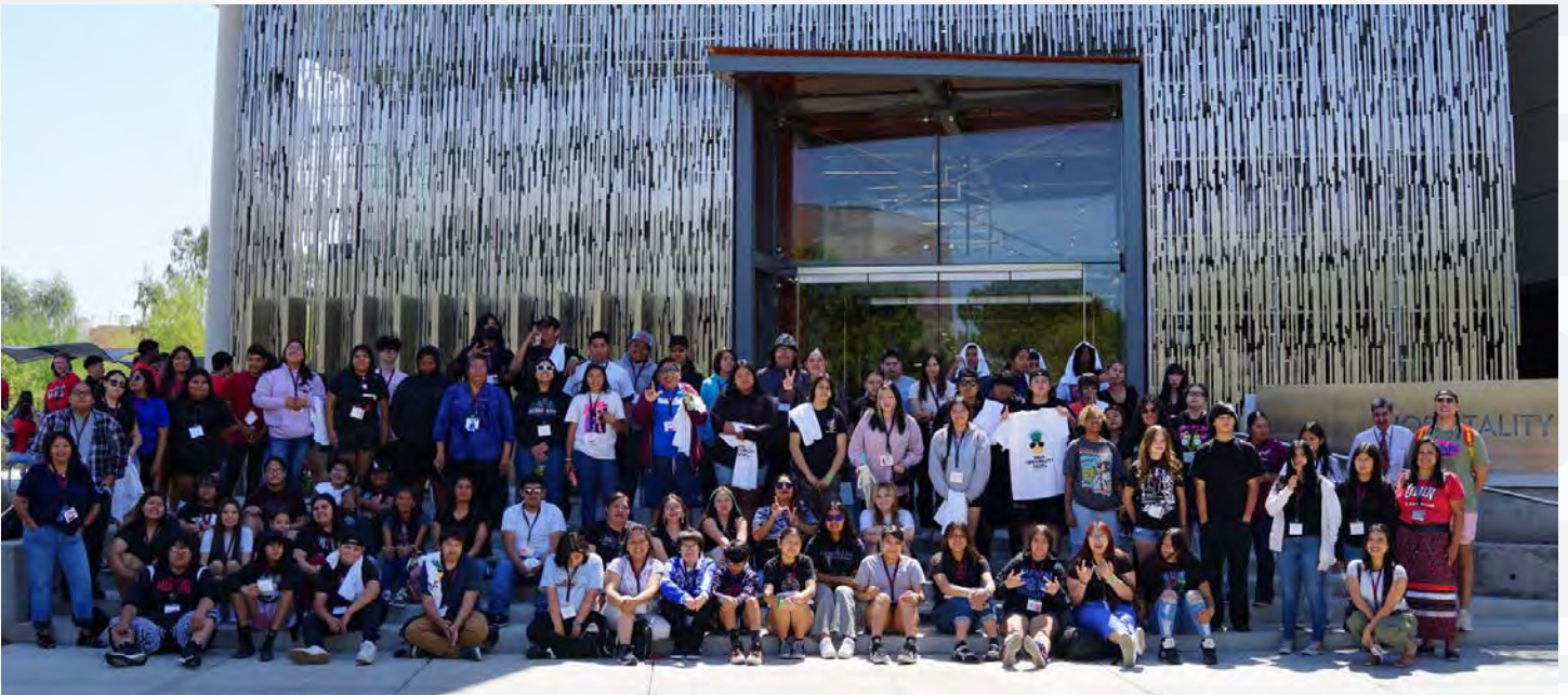
UNLV Hospitality Building

Students explored UNLV's campus, learned about the college experience, and interacted with other 7th - 12th-grade Native American students from across the state of Nevada. Students also got to interact with other Native American students and alumni who attend UNLV and meet faculty and staff. Students stayed in the dorms to gain college-life experience. Students saw firsthand the Palms Casino Resort, which is the first casino resort in Las Vegas to be fully owned and operated by a Native American tribe under the leadership of the San Manuel Gaming and Hospitality Authority!