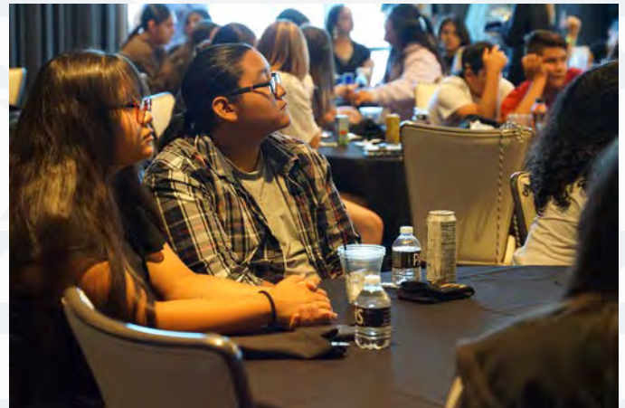
Palms Hotel and Casino